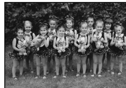
Young Children's Class "Happy Dancers"

Preballet, tap and tumbling prepares children for a more formal dance training. Each focuses on strength, coordination, rhythm, body control and self-esteem. Dance stories, props and various music is used to enhance creativity.