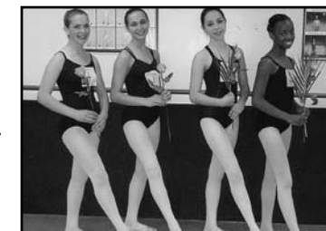
Ballet Students "Exam Candidates"

Classical Ballet is suggested for children 8 years and older. It is a disciplined form of ballet as taught in the Cecchetti Technique. Emphasis on body placement and terminology and music accompaniment is stressed.